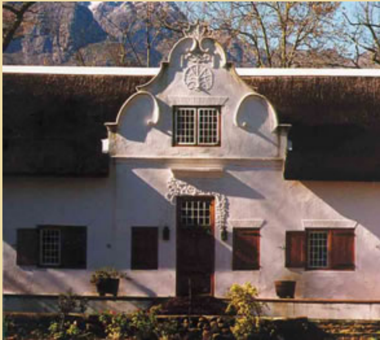
Blaauwklippen at Moddergat, Stellenbosch

by both Klein Constantia and Groot Constantia and marketed as Vin de Constance (1986) and Grand [sic] Constance (2003), respectively, are endeavours to remedy this unproductive interlude.