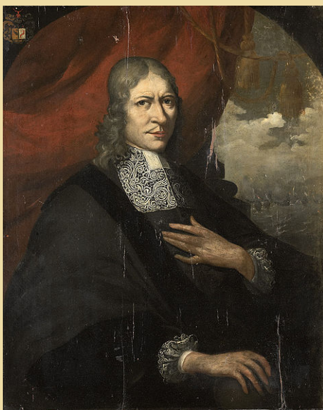
Rijckloff van Goens the Elder (1619 – 1682)