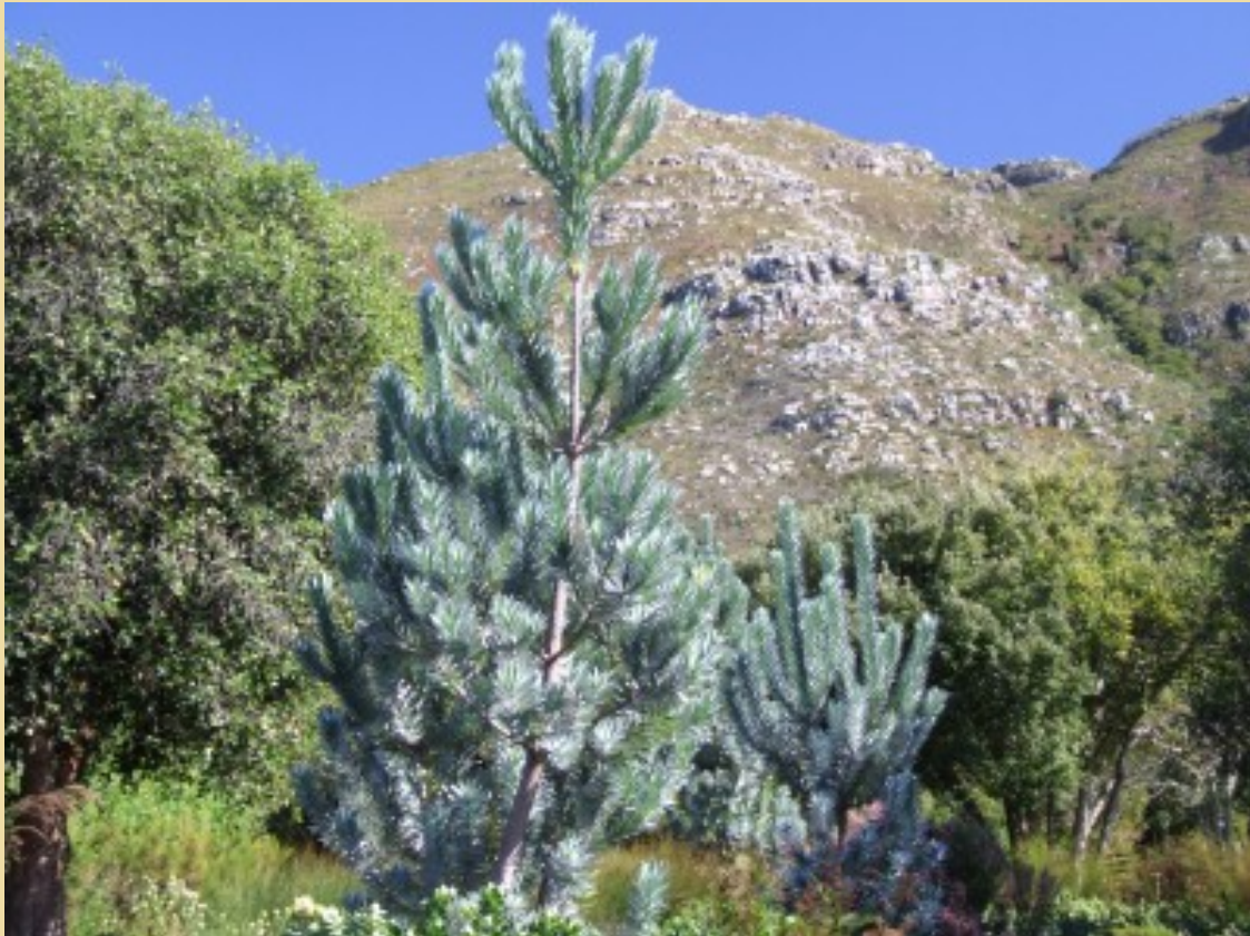
Witteboomen - Silver Tree - Leucadendron argenteum